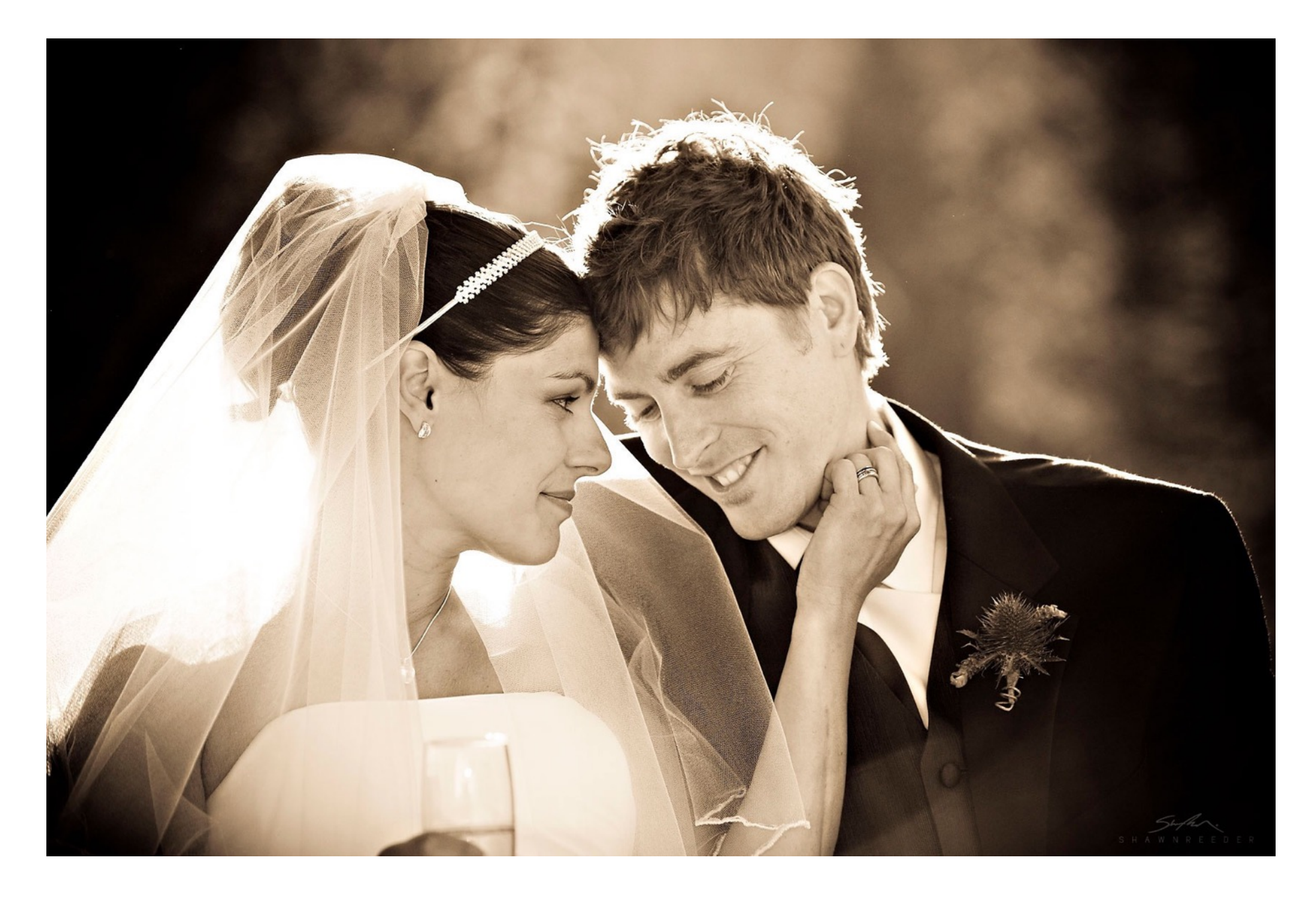
"Both light and shadow are the dance of love." \sim Rumi