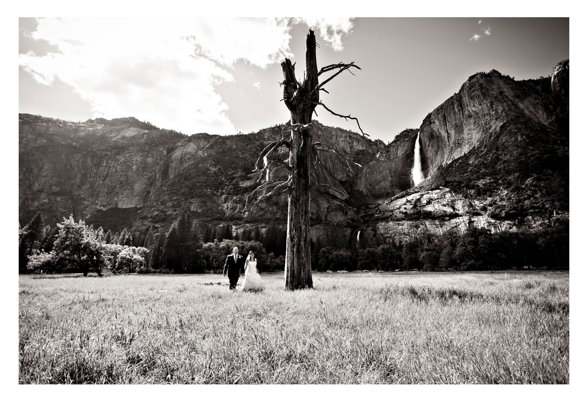
"A journey of a thousand miles begins with a single step" \sim Lao Tsu