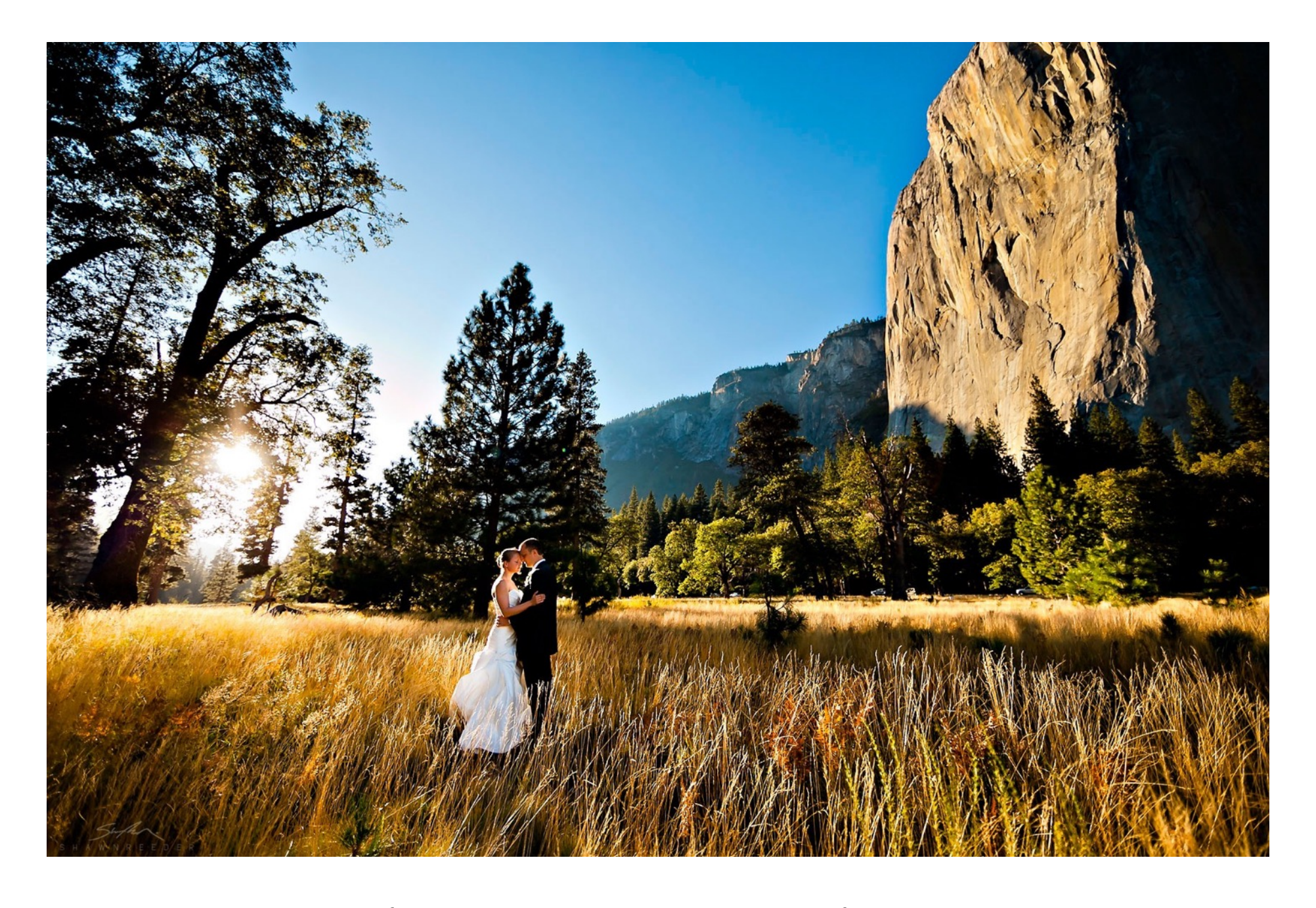
"Out beyond our ideas of wrong-doing and right-doing, there is a field. I'll meet you there." \sim Rumi